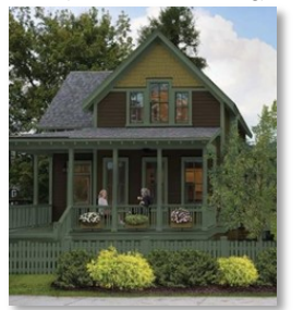
Proposed Affordable Housing Design for Young Harris

The Towns County Civic Association prides itself in addressing issues important to our county and region. Our main goal is always to keep you, especially our TCCA members, and the citizens of Towns County informed on issues that our citizens deem are important to the wellbeing of Towns County. Our membership meetings are twice a year. These meetings are our best opportunity to allow us to meet our members and to have each of us share an evening of food, friendship, fun and, more importantly, the sharing of important issues.